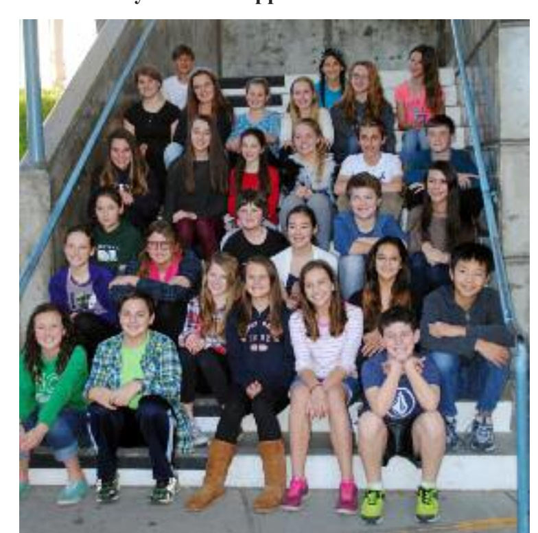
Orinda Intermediate School's Shrek Duloc cast and crew, taken on the first day of rehearsals.

Musical Jr." opens April 30 at the Farquaad, a tiny terror with big ambi-Bulldog Theater. It's a "big bright tions. When Shrek sets off with a beautiful world" in this hilarious stage spectacle based on the Oscar-winning Farquaad, he's handed a task – if he DreamWorks Animation smash hit film. This show features a host of Dragon-guarded tower, his swamp over-the-top characters in a dazzling adventure story.